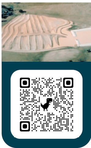
Dam Technology Gallery