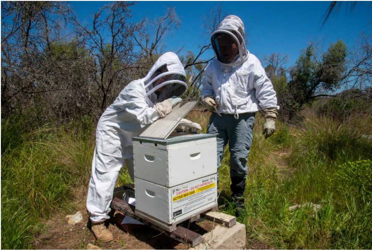
National Honey Bee Pest Surveillance program, checking for invasive species and sick bees.

Exotic bees entering WA could be a pathway for bee pests and viruses, such as varroa mite ( Varroa destructor ) which have decimated many hives and industries world-wide. Targeted surveillance is undertaken by DPIRD around WA, to protect our precious honey bees from exotic bees including surveillance for the pest; red dwarf honey bee ( Apis florea ) .