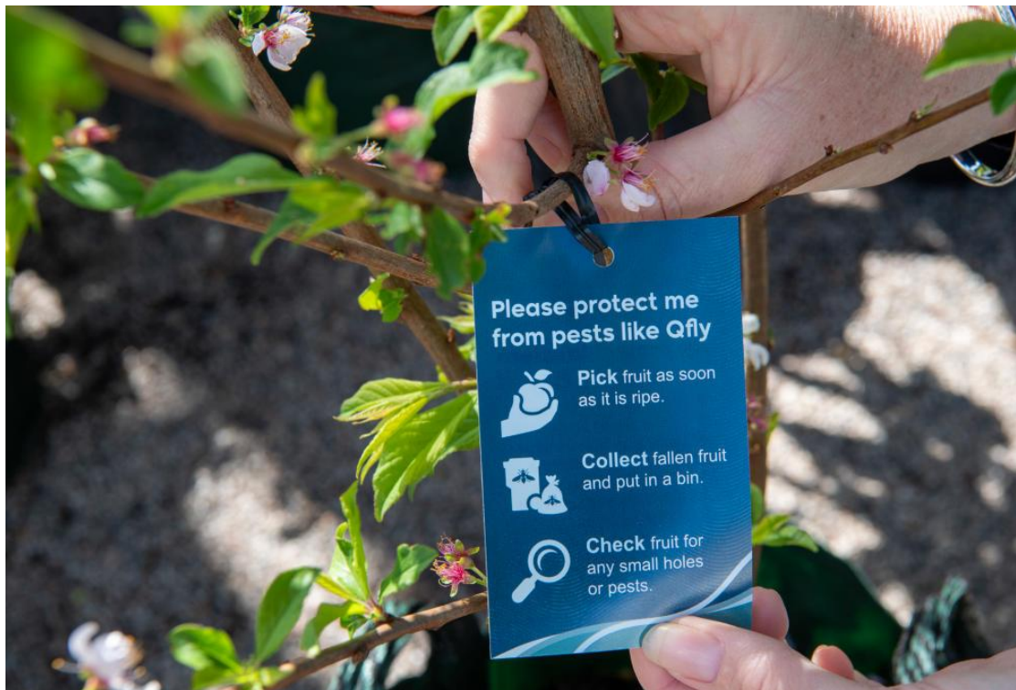
Qfly Tag- A reminder helping gardeners protect their valuable plants and to keep out destructive pests (Bayswater area)