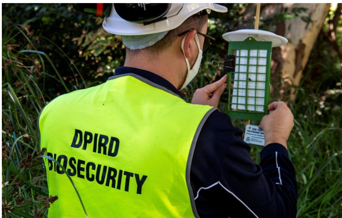
PSHB trap inspection at Mason Gardens (Dalkeith)