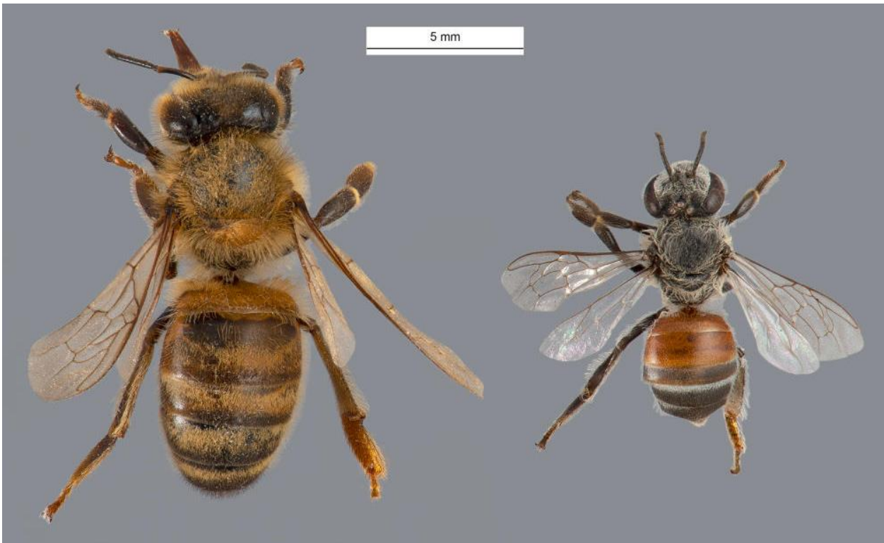
Honey bee (left) vs the Red dwarf honey bee (right) - which can carry many pests and diseases.