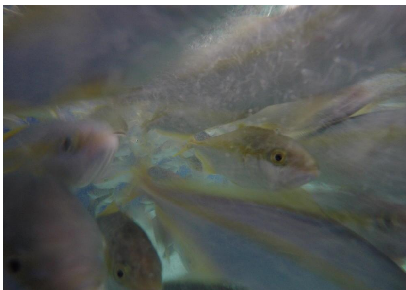
Yellowtail kingfish (AKA Yellowtail amberjack) bred and released by DPIRD fisheries, near the Fremantle Yacht Club.

Council reports are also used by DPIRD to inform continuous improvement, and specifically contribute to the Department's 'Biosecurity Futures Initiative' to develop a roadmap to reform WA's biosecurity system, to ensure it is fit-for-purpose and financially sustainable into the future. The review of the Biosecurity and Agriculture Management Act 2007 is a key element of this initiative and the first to be nearing completion.