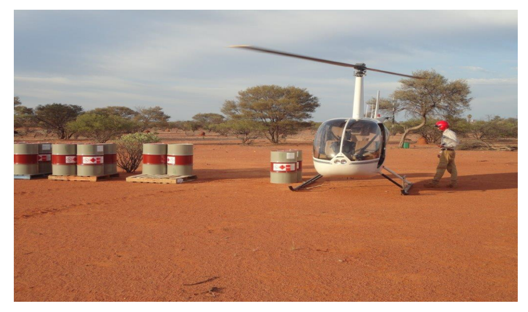
Refuelling at Meka Station - November 2017