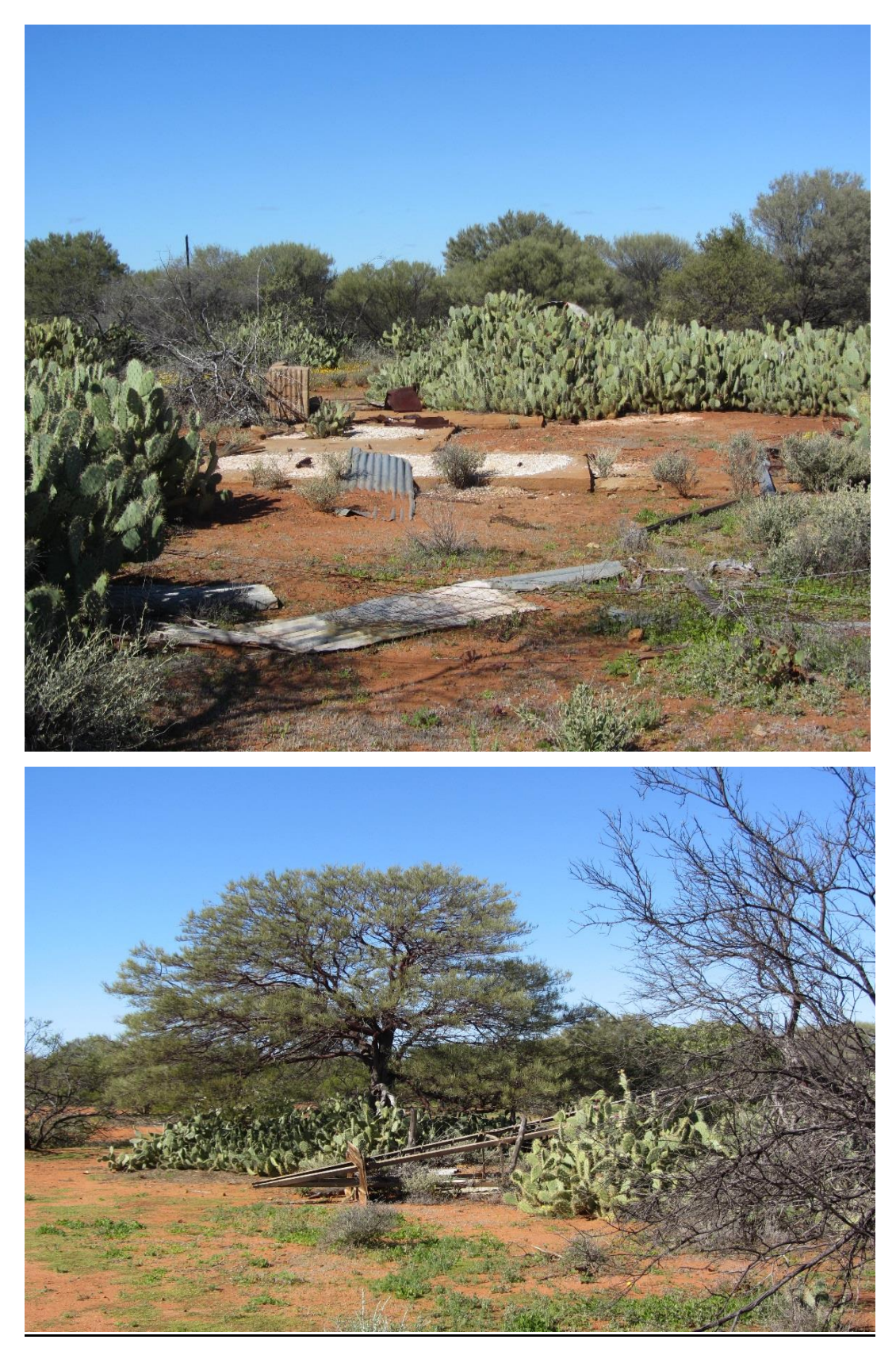
Opuntia engelmannii – Old Woogalong Homestead