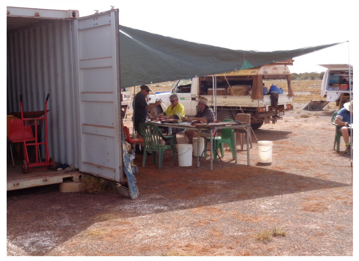
Illgararie Bait Racks September 2017

The MRBA community baiting program operates on the basis that a co-ordinated approach, where all pastoralists lay baits within the same time frame, is a fundamental component of a successful wild dog reduction program. Further details of the community baiting program are contained in the MRBA Wild Dog Management Plan which is available on request.