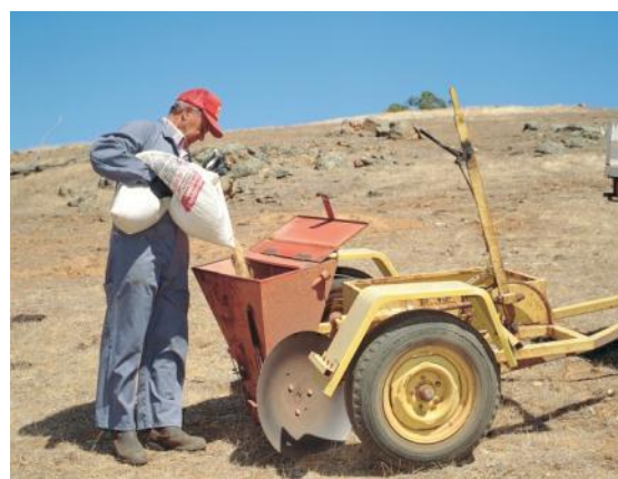
A bait layer being loaded for rabbit control

Most pets and domestic livestock are similarly quite sensitive to fluoroacetate (1080). Hence, they are also susceptible to 1080 baits. Domestic, and other dogs, are at risk both from eating 1080-baits, and through secondary poisoning. Secondary poisoning occurs when a dog feeds on the carcasses of animals (e.g. rabbits) killed by 1080 baits. These carcasses may remain toxic to introduced species (but not the more tolerant native species – see below) until they decompose within 2-8 days. Secondary poisoning in this way also provides an added advantage in that some foxes will be killed by feeding on carcasses containing 1080. Livestock can also be killed if they are allowed to feed on 1080-poisoned grain baits used to control rabbits and/or feral pigs.