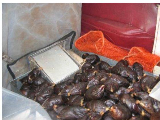
Baits ready to be distributed by plane

harmful levels and/or persist in waterways, even when quite high natural concentrations of fluoroacetate are present in the surrounding environment. Furthermore, as most 1080 is eliminated from living animals within three days, 1080 residues do not persist in meat, blood, the liver, or fat. (This is in contrast to the anticoagulant, brodifacoum and several other pesticides). Thus, bioaccumulation of fluoroacetate is very unlikely because biodegradation or elimination of fluoroacetate occurs at many levels in the food chain. This includes microorganisms, invertebrates, birds, mammals and reptiles.