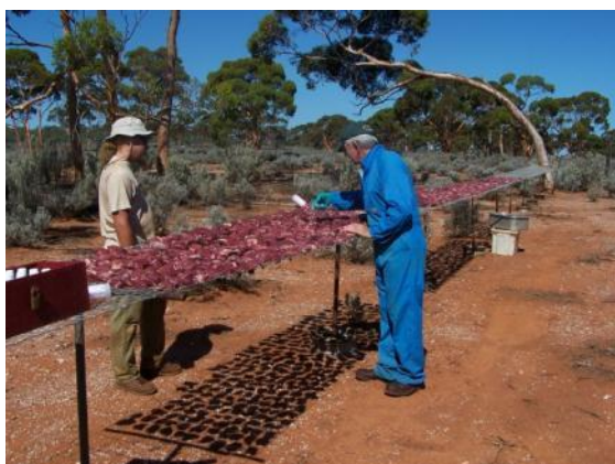
Inspecting and drying field –prepared wild dog baits

protecting biodiversity and helps to reduce the spread of bovine Tb. New Zealand sowing rates for aerial operations are 3–5 kg/ha, which equates to 4.5–7.5 g 1080/ha. This compares to around 0.00015 g 1080/ha for many fox baiting programs in Western Australia. Interestingly, areas with fluoroacetate-bearing plants can have up to 550 g of fluoroacetate per ha and yet, due to its degradation by microbes, fluoroacetate does not persist in these environments.