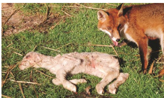
Fox predation can cause up to 30% losses of lamb

1080 was introduced into Australian rabbit control programs in the early 1950s. Since then, it has been shown to be highly effective against a number of pest species, particularly foxes, rabbits, wild dogs and feral pigs. Well-planned and executed 1080-baiting programs usually achieve rapid, high-level population knockdowns.