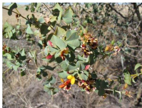
Prickly poison ( Gastrolobium spinosum ) is native to Western Australia

Fluoroacetate, the active ingredient of 1080, occurs naturally in several toxic plants in Australia, South Africa, and South America. At least 40 such species occur in Australia, with most confined to the south-west of Western Australia. All of these species are legumes but most are from the genus Gastrolobium , with one Acacia , and two species of Nemcia . Some of the Gastrolobiums can produce considerable amounts of 1080 (e.g. G. bilobum , G. parviflorum ; >2500 mg per kg dry weight of leaves). Fluoroacetate also occurs at very low concentrations in tea leaves, and guar gum, a common constituent of a variety of foodstuffs.