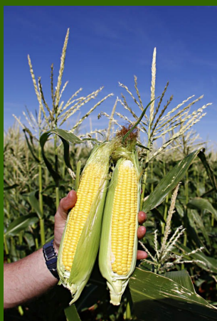
Shelamar sweet corn

Anna Plains station and the Karajarri Rangers have been working together eradicating Parkinsonia weed Parkinsonia aculeate L. on Anna Plains.