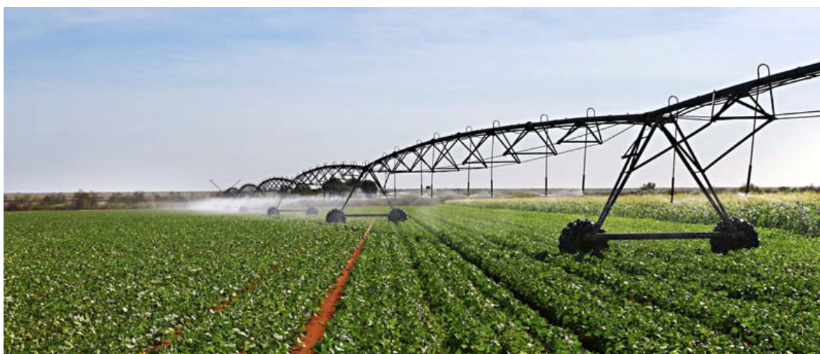
Shelamar Station beans bound for Woolworths and Coles, enjoying their morning drink

Welcome to the La Grange project update. Since our last edition the resource assessment team has completed the soil survey work and collected the rainfall data from remote regional loggers positioned before the Wet. The hydrogeology team has nominated the preferred monitoring bore sites and proposed these sites to landholders for their consideration. Local business Kimberley Water Pty Ltd has been awarded the contract to install the monitoring bores and this program will commence as soon as access to approved sites has been arranged.