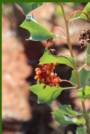
Wickham's Grevillea Grevillea wickhamii found throughout La Grange

27 Hunter Street PO Box 5502 CABLE BEACH WA