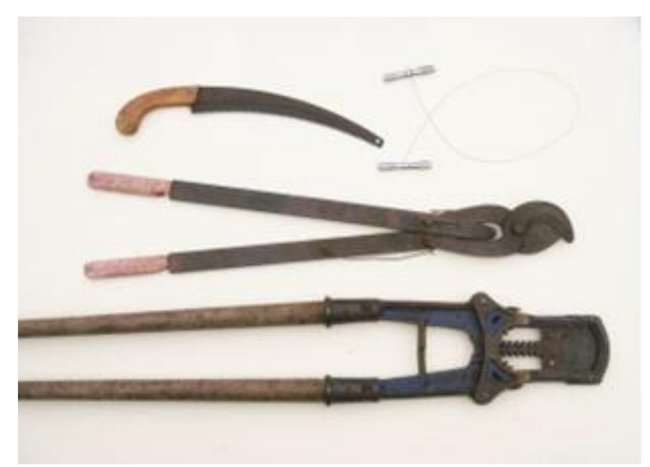
Image 5 – Instruments for horn tipping. Horn saw (top left), embryotomy wire (top right), parrot nose horn tippers (middle), guillotine dehorners (bottom). Guillotine dehorners will not fit over an ingrown horn therefore unsuitable.

NOTE: Read and follow the manufacturers label for correct and safe use.