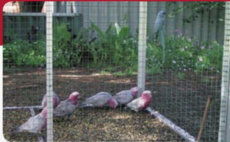
Figure 7. An escaped Indian Ringneck safely retrieved along with several Galahs.

The Chief Executive Officer of the Department of Agriculture and Food and the State of Western Australia accept no liability whatsoever by reason of negligence or otherwise arising from the use or release of this information or any part of it.