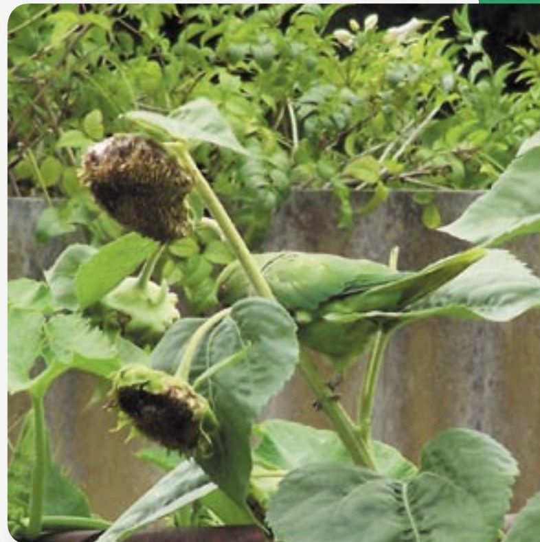
Figure 5. Spot the Indian Ringneck feeding on sunflowers in a Perth garden.

It is therefore important that birds found in the wild in Australia are removed quickly. Indian Ringnecks could threaten biodiversity here if they become established in the wild. Native parrots such as rosellas and the endangered Swift Parrot may be at risk from competition for nest hollows. Agricultural crops such as sunflowers, other oilseeds, grapes and other fruit could be at risk.