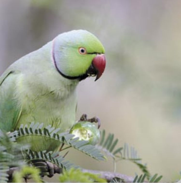
Figure 3. Male Indian Ringneck eating fruit.