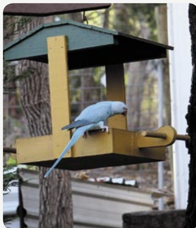
Figure 2. An escaped Indian Ringneck visiting a bird feeder in a fruit growing area near Perth (photo: Colin Daniels).

In Western Australia escaped Indian Ringnecks are often attracted to bird feeders containing seed or fruit put out for other species (Figure 2).