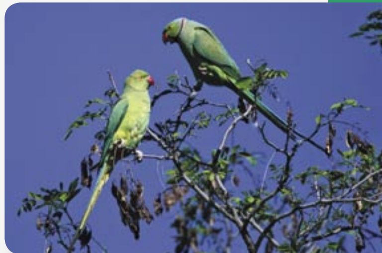
Figure 8. Indian Ringnecks established in the wild in Kern County, California.

Produced with support from the Australian Government's Natural Heritage Trust through the National Feral Animal Control Program. Endorsed nationally by the Vertebrate Pests Committee and relevant state and territory authorities. Technical information, maps and photos 5 to 7 provided and published by the Department of Agriculture and Food, Western Australia.