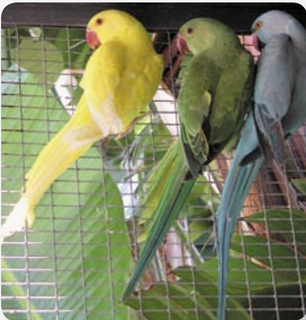
Figure 6. Indian Ringnecks that were part of a breeding group of six trapped in a Perth suburb.

Many Indian Ringnecks are caught using cage traps and relocated to the care of responsible bird keepers. Different colours, including blue, yellow, grey and white, have been bred in captivity and become common.