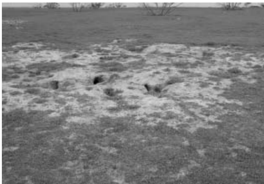
Rabbit warren in a pasture paddock.

Rabbits compete directly with livestock and many native animals for food. It has been estimated that eight rabbits