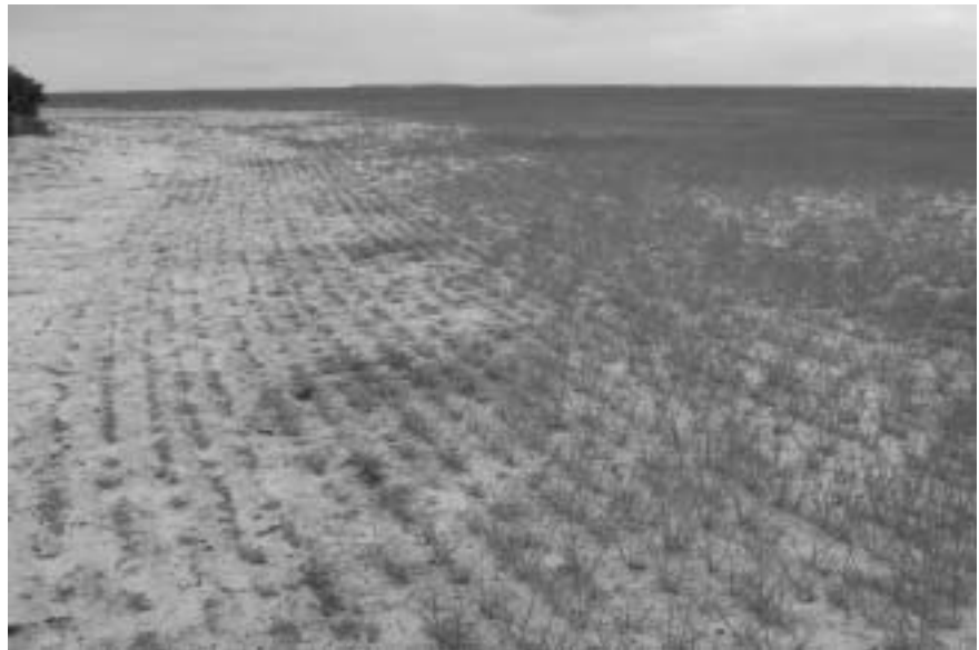
Rabbit damage is evident from this graze line on the edge of the crop.

The key to success is persistence and choosing the best control method for the particular situation. An approach that combines all possible options will give the best long-term result. The involvement of surrounding landholders will reduce the extent and speed of re-infestation as a large area will be controlled simultaneously.