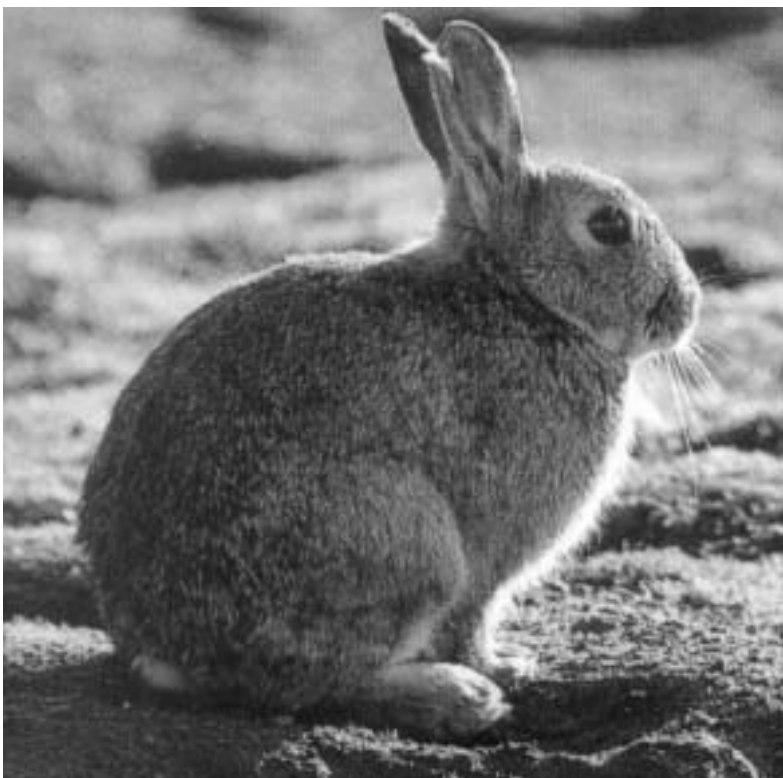
European rabbit.

During the winter breeding season, rabbits live in small coherent social groups that tend to break down in summer when breeding ceases. A large warren may contain several groups. Each social group has its own territory, which it actively defends against intruders. Members mark their territory on logs, grass or other objects with faeces, urine and secretions from a gland beneath their chins. Dominant males (bucks) will also use dung piles to mark their territories. Within each group there is a strict social hierarchy. High-ranking females (does) breed more successfully and lose fewer young (kittens) than lower ranking animals. Dominant males father more offspring than subordinate animals.