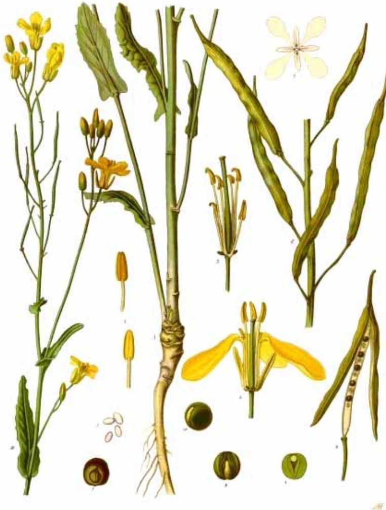
Brassica napus L. var. napus

Rapeseed ( Brassica napus ) is a bright yellow flowering member of the family Brassicaceae (mustard or cabbage family).