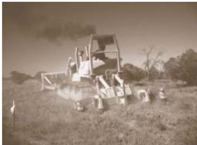
THE USE OF HEAVY MACHINERY WITH MULTIPLE TINES AND WINGED BOOTS GENERALLY INCREASES THE EFFICIENCY OF RIPPING OPERATIONS