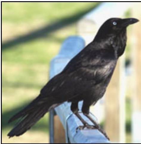
Figure 1 Australian Raven Corvus coronoides.

The Australian Raven Corvus coronoides (Figure 1), is the largest member of the Corvid family in Australia and some people call it a 'crow'. Australian Ravens are 48-54 cm in length and 500-820 g in weight. They are large, black birds with a long bill and elongated throat feathers (hackles) that are obvious when they call. The call is a drawn-out, falling 'aah-aah-aaaaahhhh'. The eyes change from blue (as a nestling) to brown and finally white (at three years of age) as they mature. Birds in their first year may appear duller in colour than adults. Juvenile birds also have shorter hackles and pink skin around and within the mouth. The bases of the body feathers are grey rather than the white seen in adults.