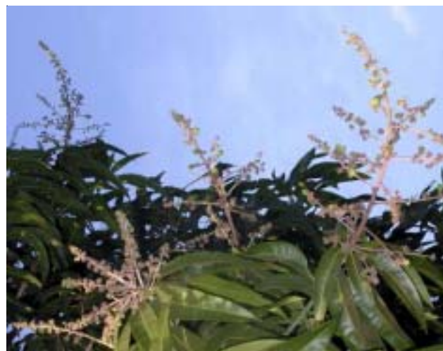
Kensington Pride can suffer from inconsistent flowering and irregular bearing.

Mango flowers form from terminal buds of the most recent mature shoots. Most mango varieties flower once a year during winter or spring following a dormant period. Flower initiation is usually triggered by cool nights and dry conditions.