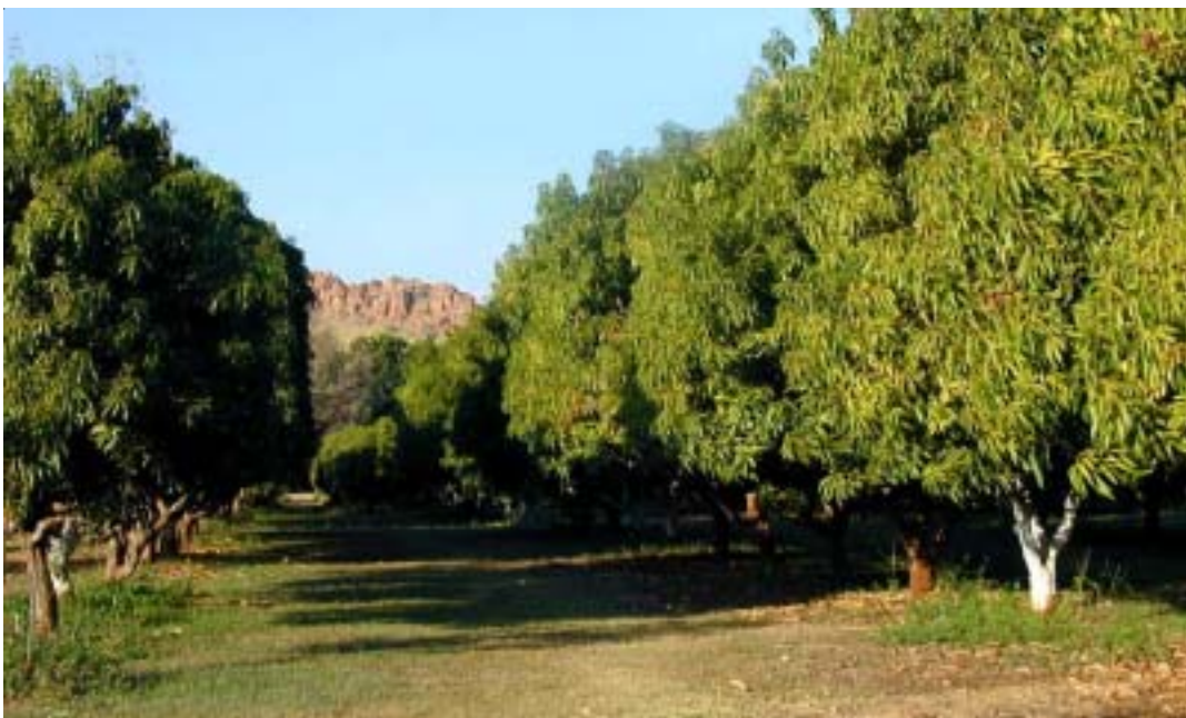
Organic mango orchard at Kununurra, WA.

Modern organic systems are largely the result of many years of on farm trial, error and improvement – typically undertaken without the routine support and scientific research effort afforded conventional growers. However, in recent years the emergence of new equipment, substances and techniques suitable for organic systems suggests the future development and refinement of organic systems will accelerate as will the provision of professional supporting services. For new entrants into organic production this means the path to success may be less arduous. However, establishing an organic system typically requires a fundamental change in approach – toward a biological basis for production management. Motivation and commitment to this biological approach is seen as an essential requirement if the development of a reliably profitable and robust sustainable organic system is the business objective.