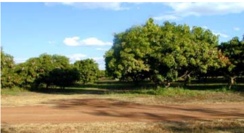
Several adjoining conventional rows (left) are managed organically to act as a buffer for the organic mango block (right).

Understanding some of the complex interactions between orchard floor cover plants and orchard trees can reveal strategies to manipulate the respective growth patterns for productive advantage. For example, it may be possible to encourage certain beneficial insects by allowing some orchard floor plants to flower. The integration of weed control objectives with cover plant manipulation can require skilful management and careful timing.