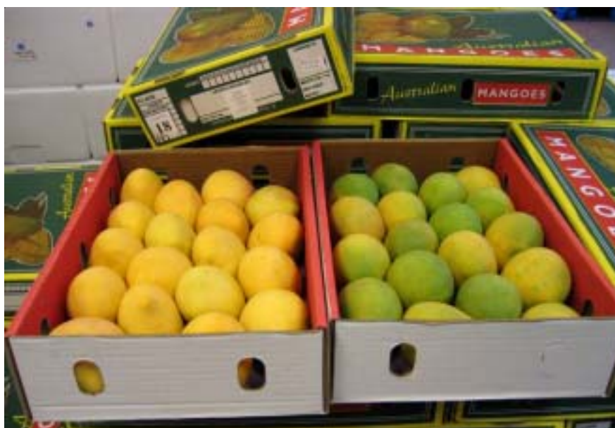
Premium organic markets demand high quality fruit.

The present growth in domestic WA organic sales has been achieved at relatively high price premium and without any coordinated marketing strategy. As yet little promotion and advertising of organic mangoes has taken place, indicating that demand continues to be driven by ‘consumer pull’ rather than ‘retail push’. This suggests a well designed and implemented market development plan, combined with a carefully planned pricing strategy, would stimulate significantly greater consumer demand than current levels.