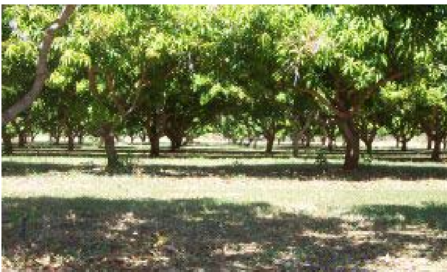
Orchard floor cover plants require timely management.

Costs associated with orchard floor cover management can relate to equipment and labour time for mowing, and additional irrigation costs to grow cover plants over more of the orchard floor.