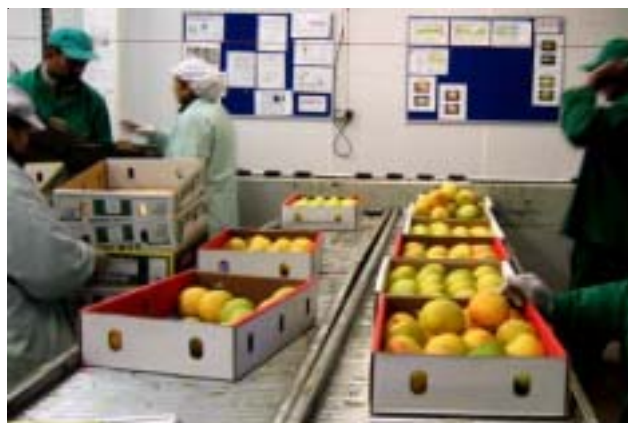
Treat organic fruit as a separate operation from conventional fruit.

Producers who convert only a portion of their orchard to organic (known as 'parallel production') are likely to have both conventional and organic product moving through the same pack-house facility. The post-harvest procedure normally adopted is to run organic fruit first after the equipment has had a clean-down. This allows the organic product to be dealt with and packed away in a separate area prior to commencing with the conventional fruit and so avoids the risk of contamination from conventional fruit and related treatments.