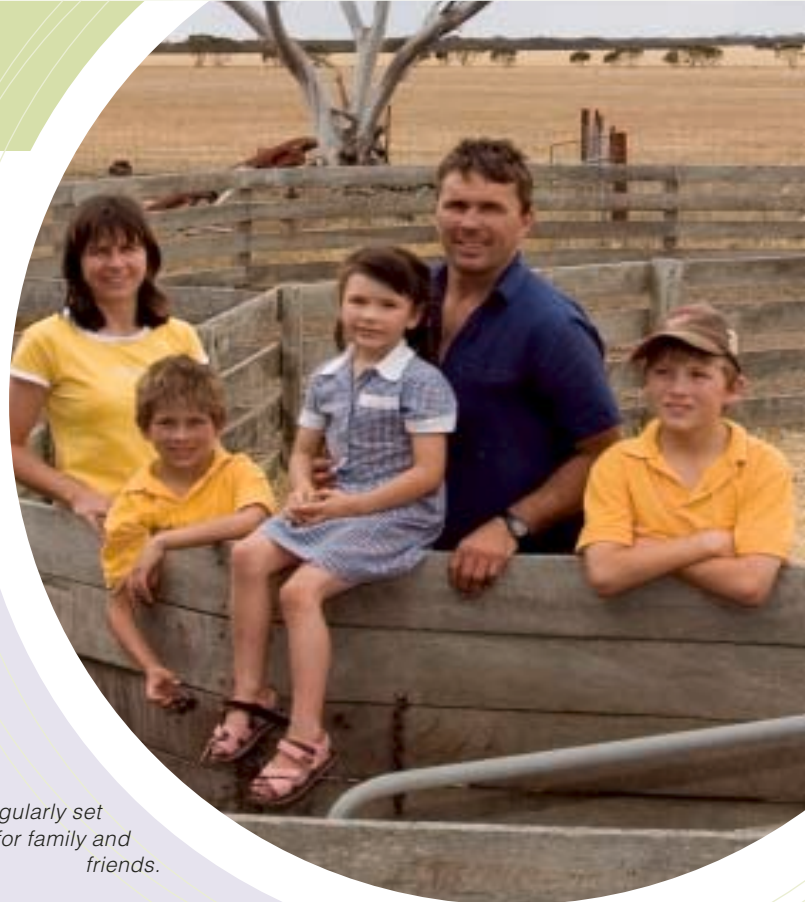
Time is regularly set aside for family and friends.