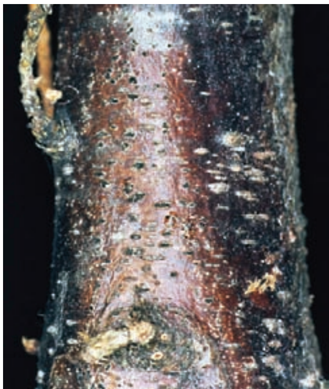
Fig 2. Fruiting bodies appear as tiny black circular areas on the bark.

Wood underneath the bark develops a reddish-brown discolouration.