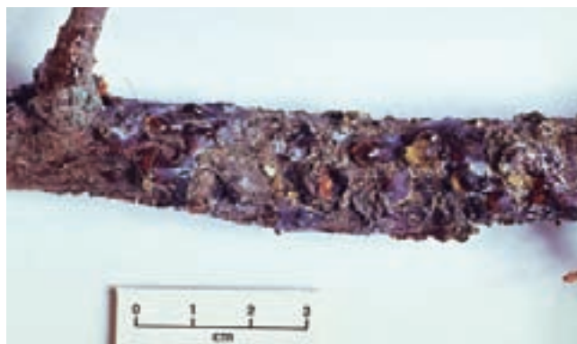
Fig 3. Stem canker showing profuse resin bleeding.

Healthy plants will be better able to resist infection so it is important to feed plants regularly and irrigate if necessary. The application of sprays to prevent insect attack may also reduce the chance of infection through those wounds. Infected branches should be pruned 10 cm below the canker to prevent infection spreading to the main stems. Tools should be sterilised before and after use with alcohol or dilute bleach. Severely