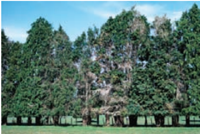
Fig 1. A shelterbelt of Chaemaecyparis lawsoniana infected with cypress canker.

Many of these species are widely planted, for hedging, shelter or as specimen trees due to their adaptability to a range of soil conditions and the range of shapes and sizes available.