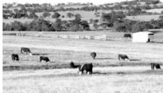
Cattle yards must be free of contamination.

Holding paddocks and yards may require testing to ensure that levels of soil contamination (from previous use of chemical treatments) are below maximum permitted residue levels. Excessive contamination may require yards to be relocated or top-dressed with acceptable material. Yards and handling facilities should be designed and maintained to ensure animals are not stressed or injured.