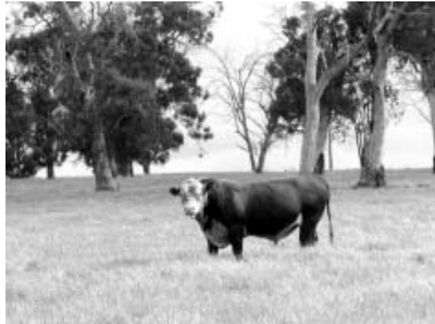
Natural breeding is preferred, although AI is permitted.

To give animals natural immunity against infection, calves should be reared by their mother. Suckling or bucket-rearing on organic whole milk for a minimum period after birth can be required in organic standards.