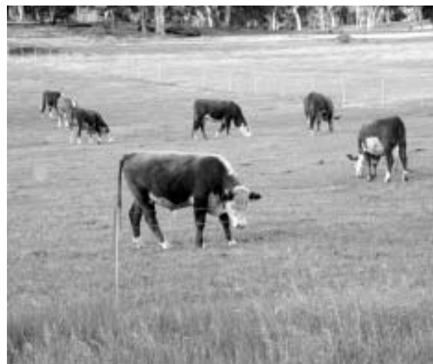
Rotational grazing systems are preferred.

Rotational grazing systems are preferred in organic production, and can be designed to optimise pasture use, maintain pasture composition and control parasites. Rotational grazing can also improve soil structure and fertility recovery, and is believed to allow pasture to develop to its full size so roots penetrate deep into the subsoil.