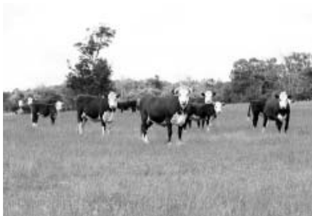
Animals must have free access to pasture.

Rumen modifiers and activators may be permitted on a restricted basis depending on rates of application, purpose of use and