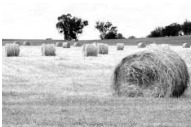
Good quality hay or silage can be essential.

Good quality hay or silage is essential for some organic operations to maintain desired productivity and finish quality throughout the year, especially during feed gap periods. Some producers believe it is prudent to retain 18 months' supply of stored feed. Where significant quantities of hay or silage are removed, regular fertilising with acceptable forms of phosphate and potash may be required.