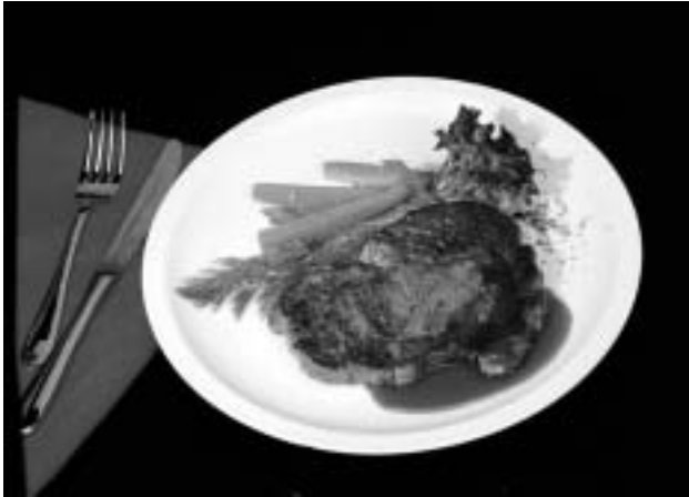
Premium eating quality biodynamic beef