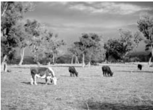
Premium organic markets demand tender beef

Some Japanese buyers are looking for specific cattle types with high marbling scores for the organic market. One recent report from Japan suggested that grass-fed beef was considered less tender than feedlot beef and perhaps more suitable for processing or restaurants rather than for individual consumers. (This perception may require attention if organic grass fed-beef is to attract premium markets.)